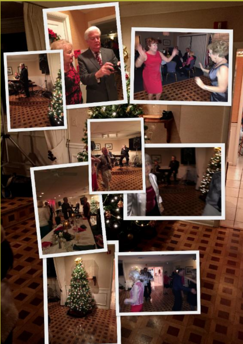
Vero Beach Parade