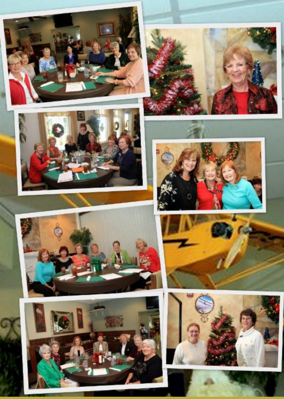
Christmas Party at the VB Yacht Club