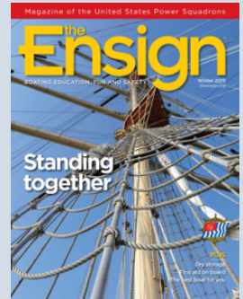
Ensign Winter 2015